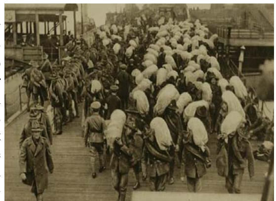
New Zealand Soldiers offloading in France

The responsibility placed on the shoulders of the nations young boys due to the pressures of the war changed society drastically. As there was now a country where it was basically running on undereducated youth trying their best to achieve where they had little experience.