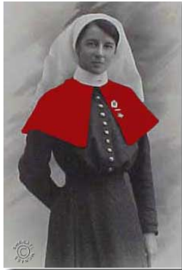
New Zealand Nurse WWI

areas surrounded by the war. The troopship Marquette was carrying a large number of nurses and soldiers across the Mediterranean in 1915 when it was torpedoed. The ship sunk taking 10 nurses lives and injuring many more. This