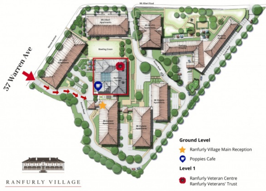
Ranfurlly Site Map