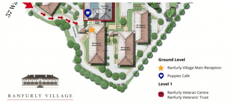
Ranfurlly Site Map