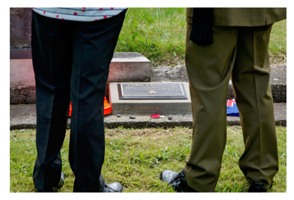
A newly unveiled memorial plaque

The ceremony concluded with the unveiling of the 34 plaques by members of 5th/7th Battalion.