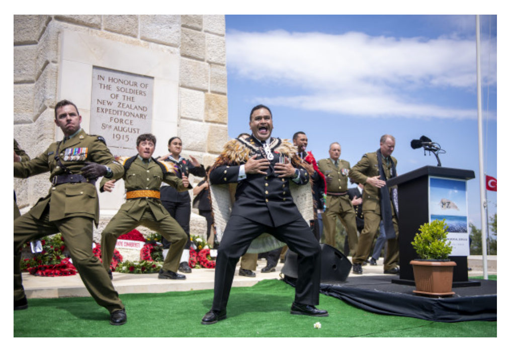
The Māori Cultural Element

Official speeches were supported by performances by the NZDF band and Māori Cultural Group, while Australian and Turkish military personnel also conducted ceremonial duties during the service.